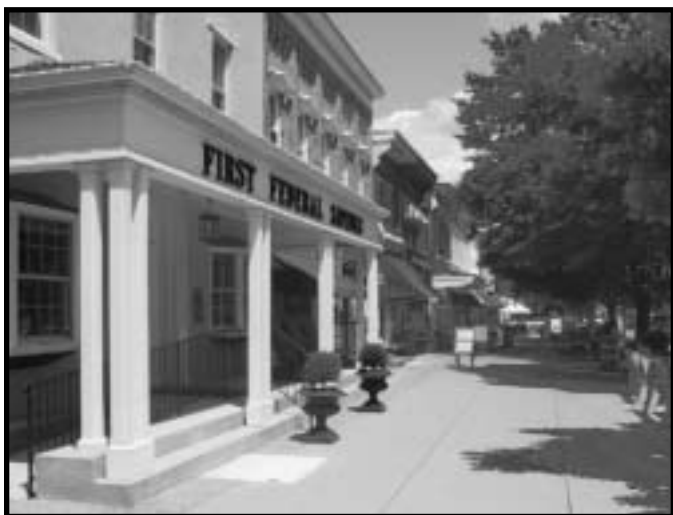
The planned expansion of Route 161 threatens the small town of Granville, home to Denison University, with accelerated sprawl and more pollution.

Indirect environmental impacts also are likely to occur along this corridor. The New Albany area is rapidly growing, primarily because of the New Albany Company's aggressive residential development in the area, together with the construction of the first phase of the Route 161 expansion. After ODOT completes all of the expansion projects in the corridor, more than 50 miles of four-lane divided highway will extend eastward from Columbus into Muskingum County, thereby facilitating sprawl eastward from New Albany into Granville, which already is experiencing rapid development pressure.