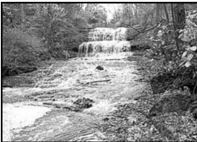
Most of the expanded highways discussed in this report will cross dozens of streams and other water bodies — which often requires the use of concrete diversion culverts — and the highway traffic pollutes the water with storm water runoff.

The Route 161 corridor east of Columbus to Newark is an excellent location for a regional rail transportation network. Yet in part because ODOT has segmented expansion of this corridor into small pieces, the rail option does not receive fair evaluation as a cost-effective and environmentally preferable solution to traffic congestion throughout the corridor.