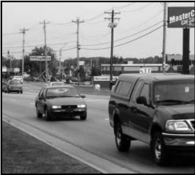
Sprawl already is rampant along I-71 north of Cincinnati in Warren County, where land development has outpaced population growth by a 5-1 margin in recent years. Expanding I-75 north of Cincinnati and south of Dayton could fuel similar unplanned development.

As laudable as OKI's study program is, it is not occurring within the parameters of an EIS. Politics and other subjective factors are more likely to influence OKI's results and recommendations. As a result, there is a real risk that the final list of "preferred" projects (for example, lane widenings) will become the pre-ordained choices for expanding I-75, even before ODOT performs an EIS. An equally serious risk is that even if OKI's recommendations do include a range of alternatives, ODOT might ignore them, and instead segment the expansion program into small pieces for the EIS process. ODOT then would be much more likely to choose "business as usual" solutions – such as lane widenings – that do not solve long-term congestion problems and worsen sprawl.