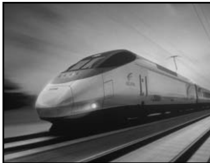
Faster than cars and often more convenient than air travel, high-speed passenger rail is becoming a viable transportation alternative for short and medium distance travel, such as the Cincinnati-Columbus-Cleveland corridor.

3. The EIS identifies in detail all of the environmental impacts of each alternative. Environmental impacts include the obvious direct impacts of construction projects, such as losses to farmland, forest, wetlands, streams and pollution, and harm to cultural, recreational and historic areas. Environmental impacts also include indirect or secondary impacts , such as sprawl, demographic shifts, and economic changes. 3 Sprawling commercial and residential development, for example, may occur following construction or expansion of a major highway, especially in growing areas.